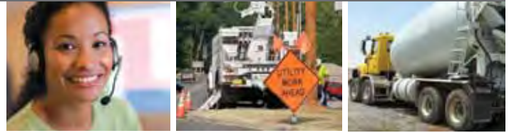
SimpleTrack is ideal for utilities, delivery firms, taxi services, and more!